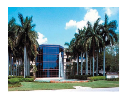
Visit Us At Our Location!

For every 60 minutes you spend making money, spend 60 seconds thinking about how to protect it!